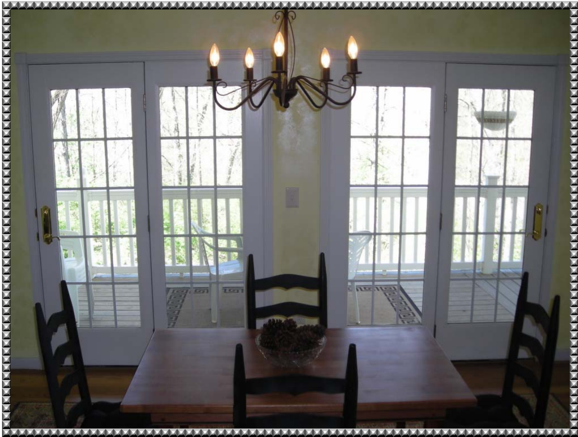
Views & Nature