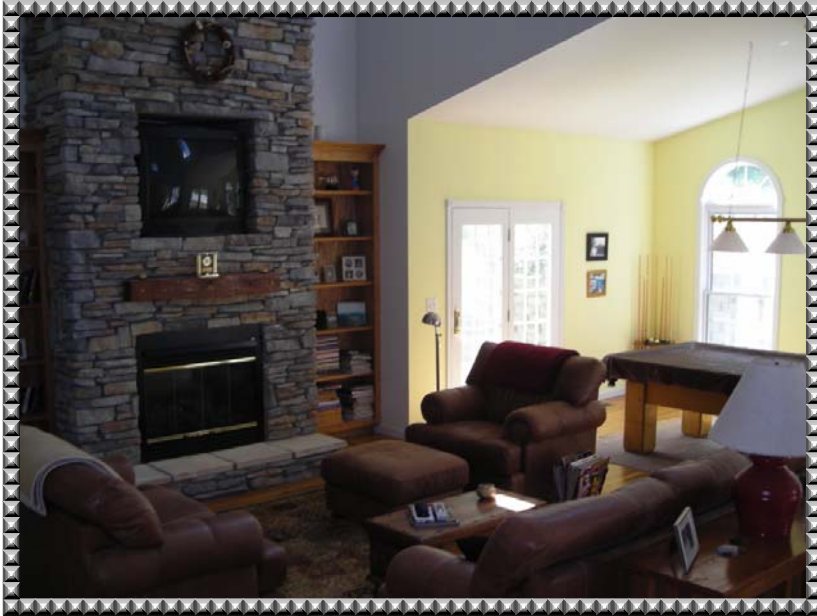
Easy Open Spaces!