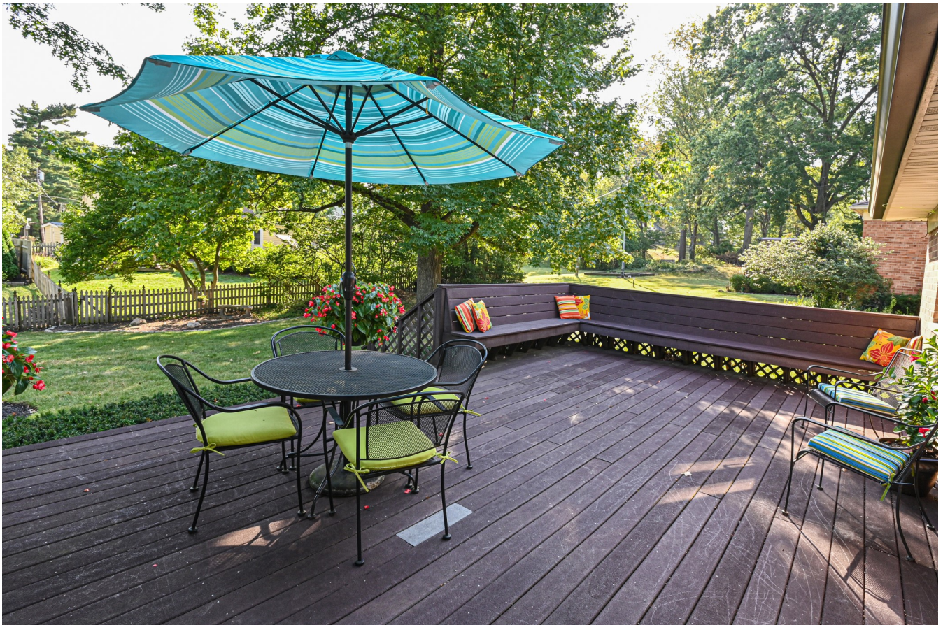
Good Times and Trex “No Care” Decking