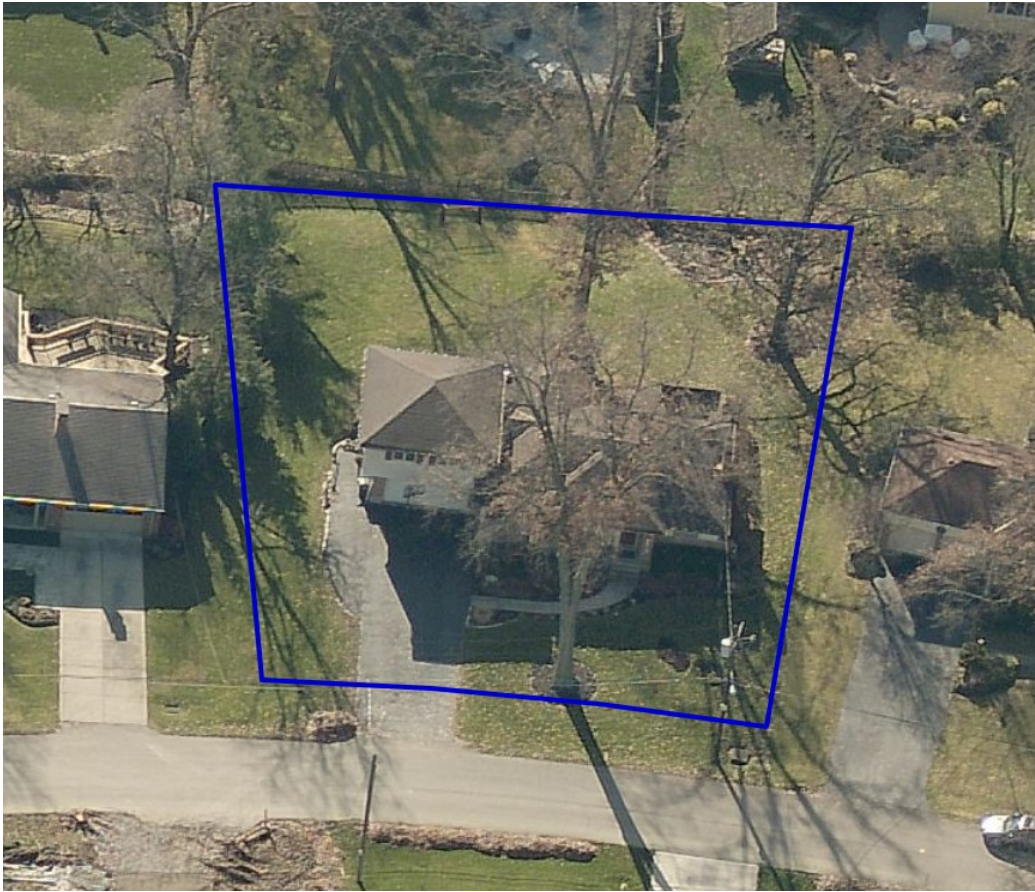
Madeira's Best Address