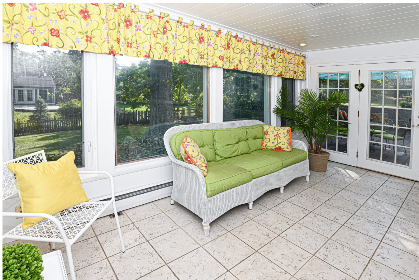
Light Filled Solarium!