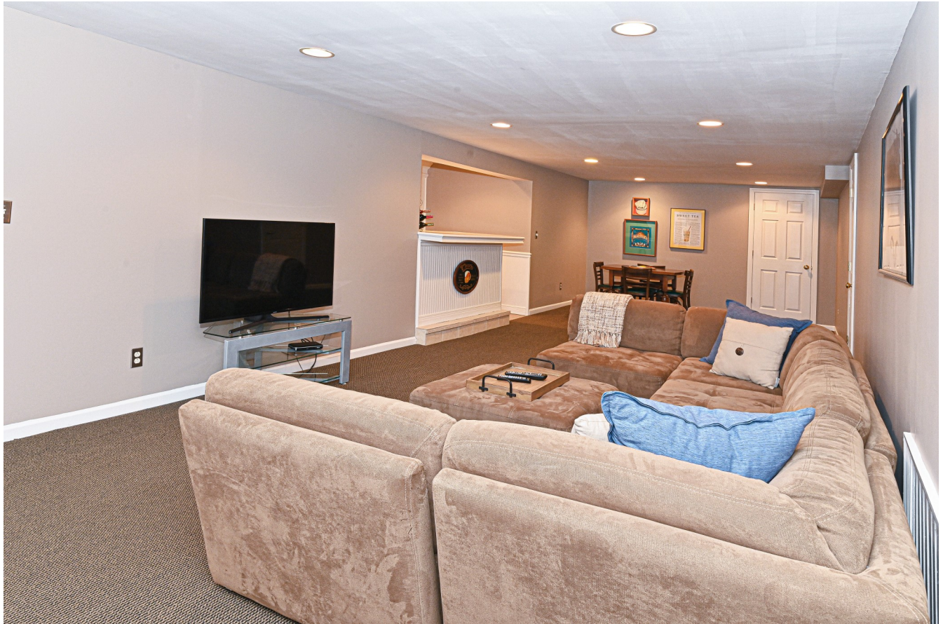
Room to Roam Entertainment!