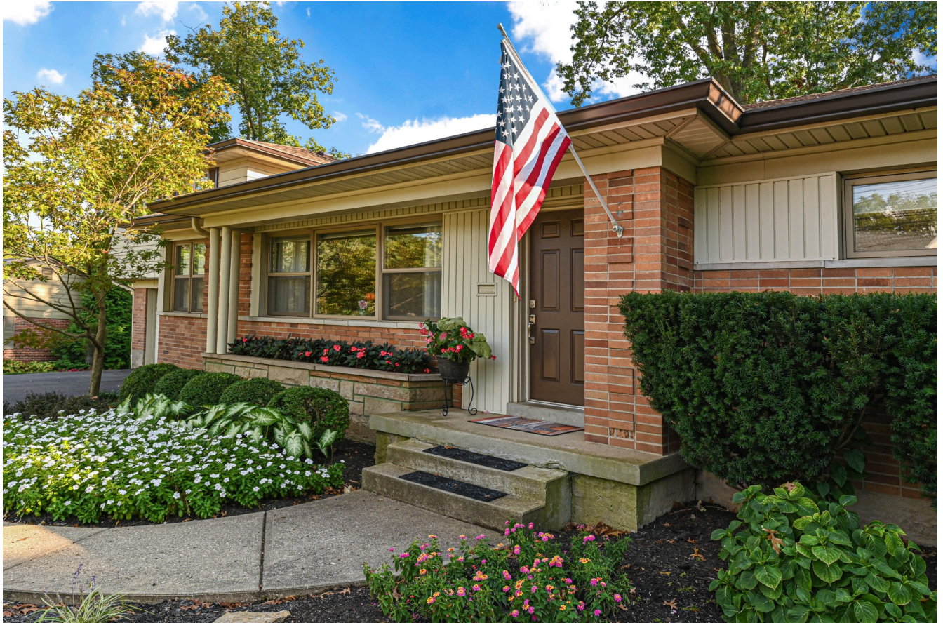
At home in a Park