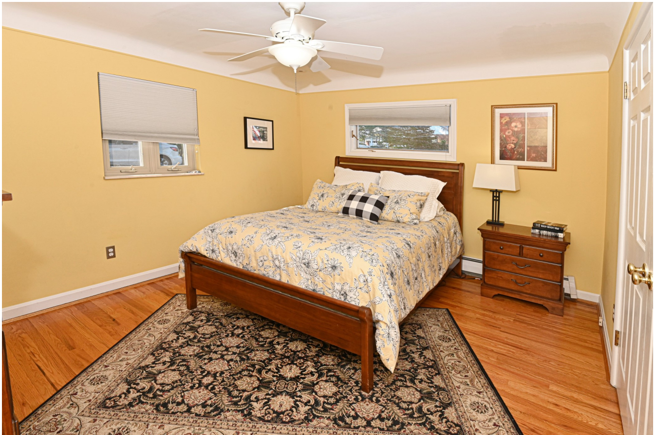
First Floor Master & Study!