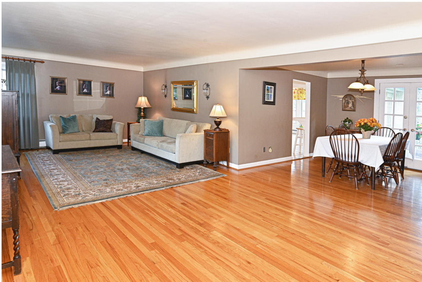
Fresh Open Spaces!