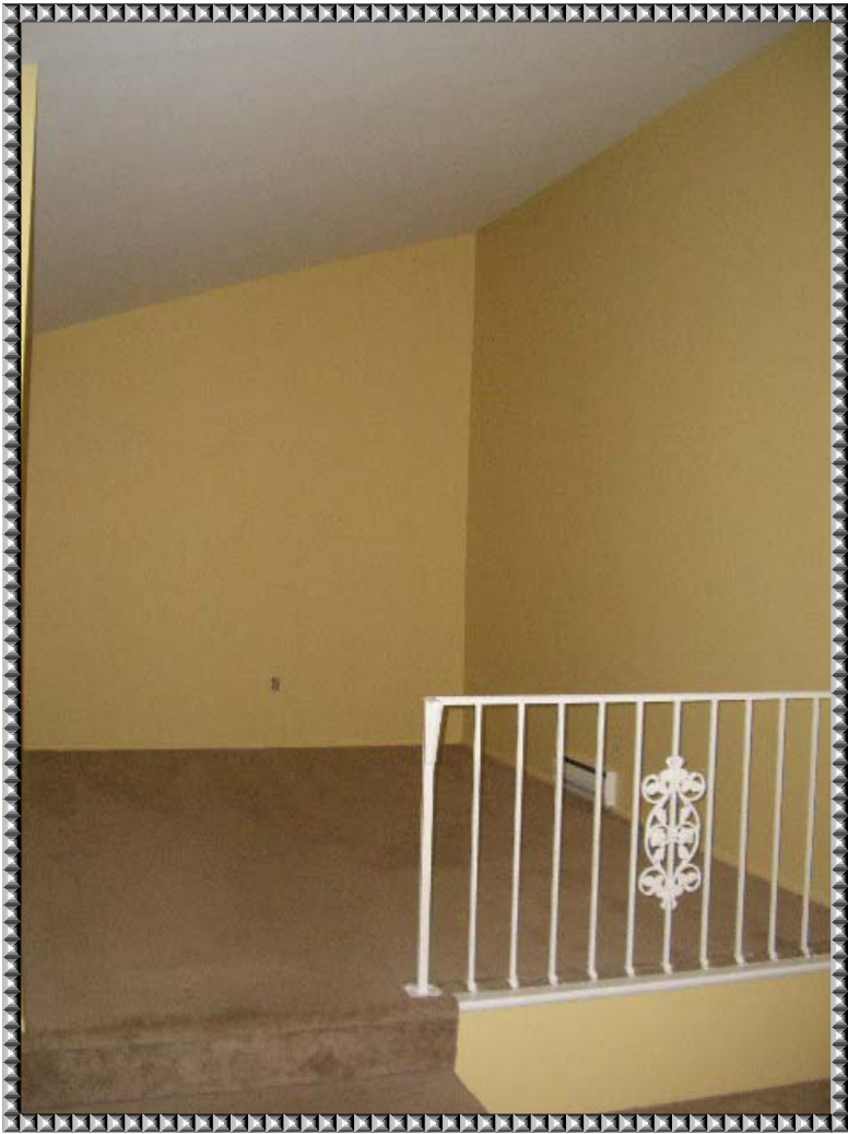
Living-Dining Great Room!