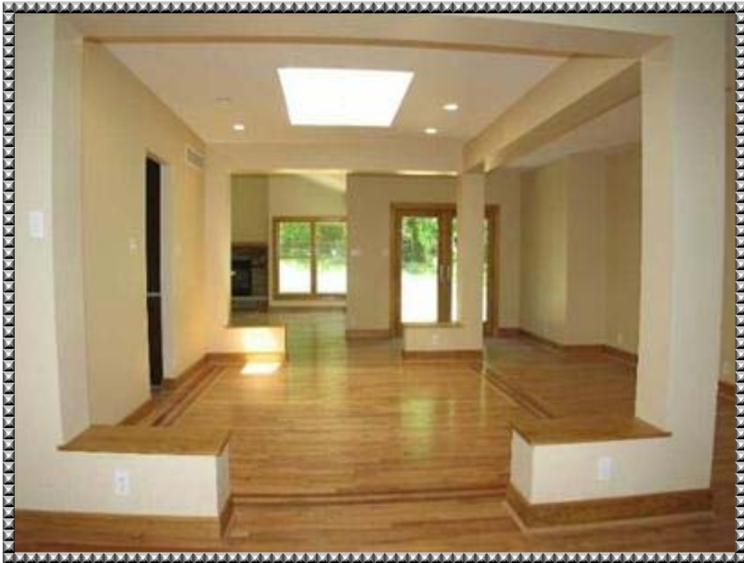
Fresh, Open, Quality Abounds!