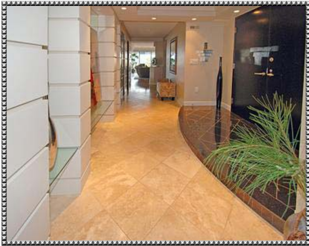
Polished Marble Entry!