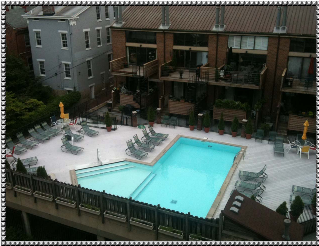
Waterfront & Pool Views!