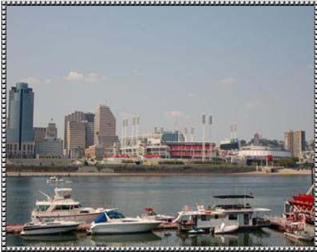
The Excitement of Marinas & Lit Up Cincinnati!