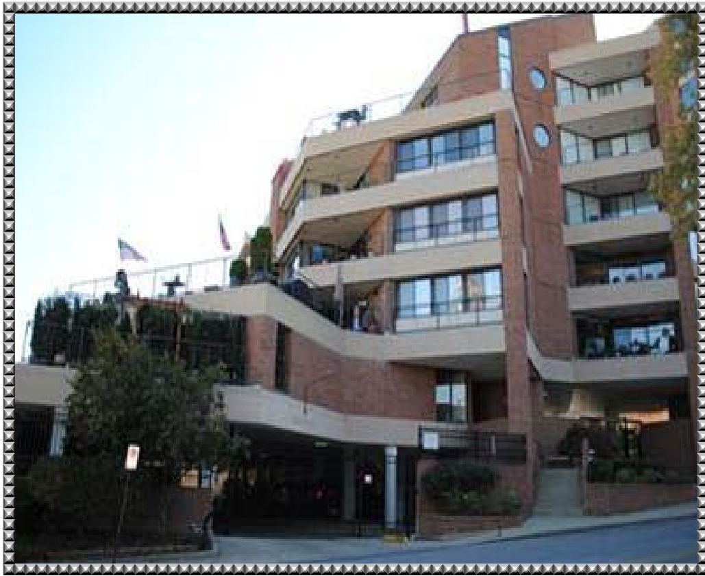
Historic Covington Penuche!