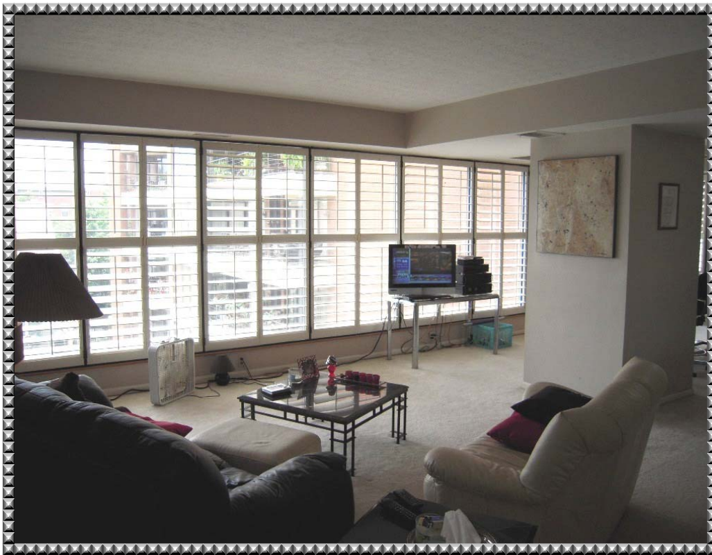
One Floor Living & Glass Walls!