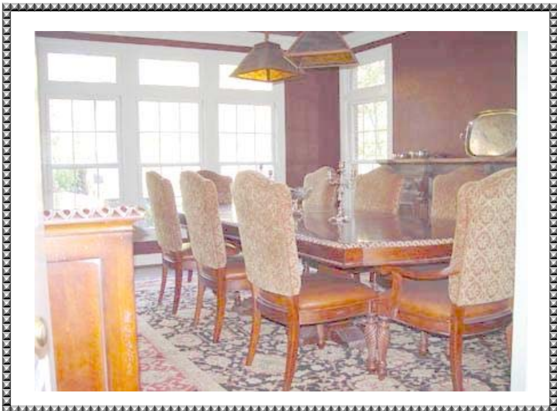
Dining...Ron Hammonds Interiors