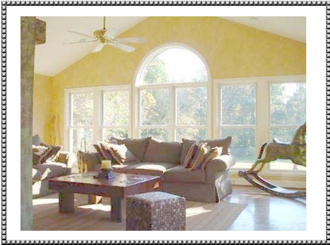
Four Seasons Room!